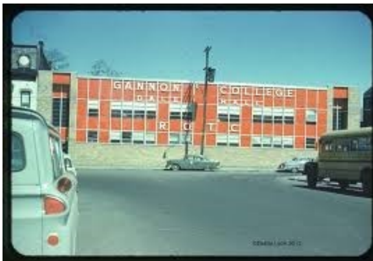
Gannon ROTC was so big during the early 1960s that the department had its own building on South Park Row.

The American flag was always held higher than any other flag (or flags) in a color guard, so that the cadet next to me was carrying his pole in an almost upright position. Distracted by efforts to avoid stepping in dung, the American flag bearer somehow caught the top of his pole in a low-hanging tree branch. As it turned out, it had been my responsibility to command him to temporarily lower the flag. Oops! Not only did he catch his flag pole in a branch, but try as he might, he could not extract it. Meanwhile, the band was bearing down on us from the rear and they had become aware of the swath of manure that had consumed the color guard. Not knowing what else to do, I raced to the curb, leaned my M-1 against a tree, and returned to help untangle the flag. In the chaos that ensued, the band marched around us, with members alternatively stepping in poop and cursing. Meanwhile, the four-person color guard was swallowed up and ultimately passed by the band as well as most of the 200 troops. My decision, flawed as it turned out to be, was to re-assemble the color guard and follow the brigade the rest of the way to Bayview, taking up the rear.