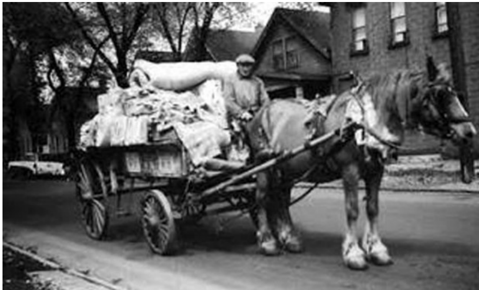
The neighborhood Ragman and his trusty horse