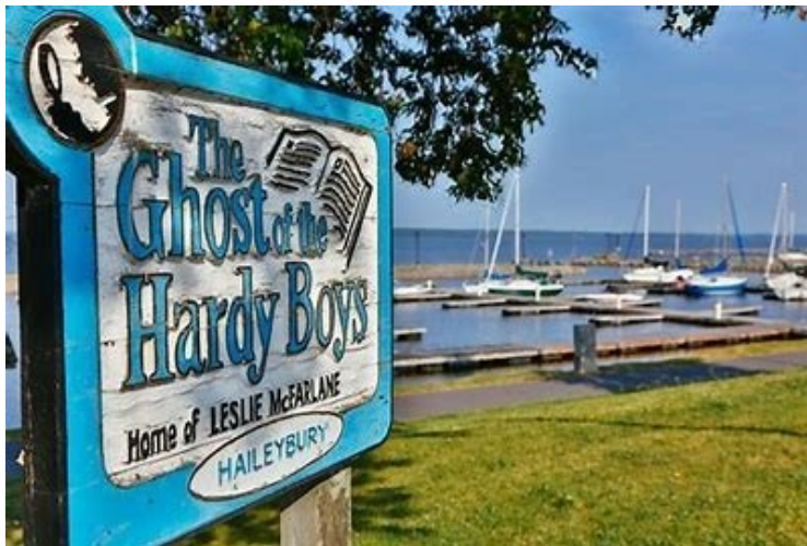
This sign graces the Haileybury, Ontario town marina.