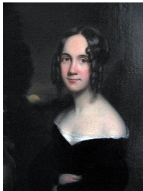
Sarah Josepha Hale

What could be controversial about Thanksgiving Day?