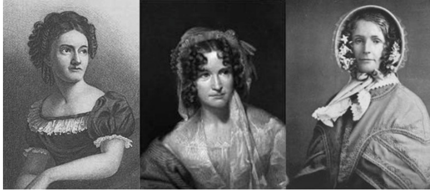
Lydia Maria Child

So, who was Lydia Maria Child? Well, she was no shrinking violet and, I suspect, she was someone who irritated Sarah Josepha Hale. Although she had started to write before she married and her husband did not die, his inability to earn a sustained income drove Child to follow Samuel Johnson's famous dictum – "No one but a blockhead ever wrote for anything but money." Child became one of the most successful American writers of the 19th century.