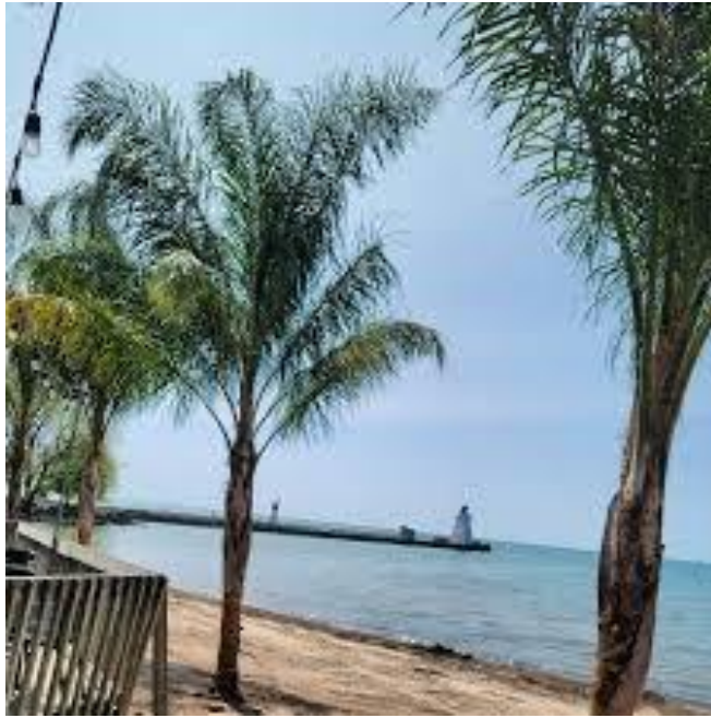
The amazing, but strange palm trees in front of the Beach House (Callahan's) Restaurant on the water. Somehow, they seem to survive there. Note the string of holiday lights.