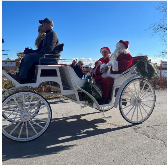
Santa and Mrs. Claus in their carriage

Santa quickly becomes the grand marshal of the annual holiday parade. He and Mrs. Claus climb into a horse-drawn carriage and join the festive assembly of floats, marching bands, and other delightful small-town attractions. It may not be the Macy's Thanksgiving celebration, but small-town parades have a special charm of their own.