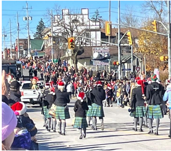
Can't have a Canadian parade without pipers.

The parade is just the beginning of a wonderful daylong celebration, which includes the lighting of the Christmas tree in Powell Park, meeting Santa at the Lighthouse Theater, and tax-free shopping.