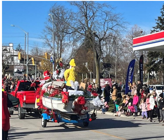
The Port Dover Yacht Club "float"