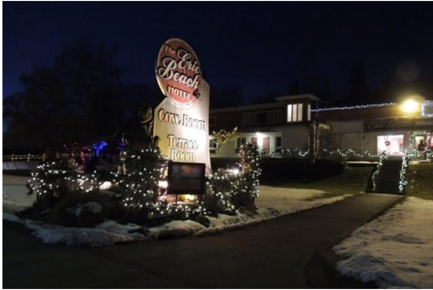
The Erie Beach Hotel with its wonderful Christmas lights