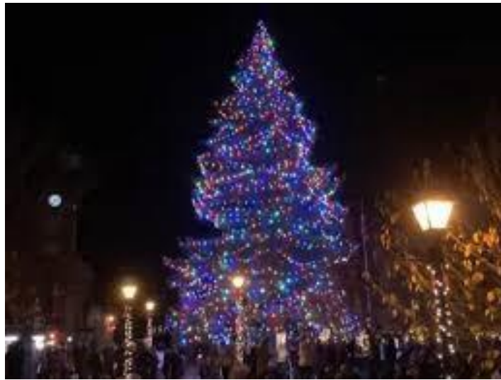
Another magical moment is the annual tree lighting in the park.

The parade is just the beginning of a wonderful daylong celebration, which includes the lighting of the Christmas tree in Powell Park, meeting Santa at the Lighthouse Theater, and tax-free shopping.