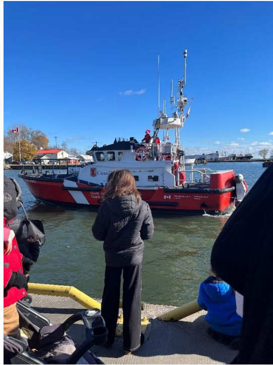
The Canadian Coast Guard escorts Santa into town each year. Note the red Christmas hats.

With the assembled crowd cheering, the Coast Guard cutter swings around in a circle after which a fish tug with Santa and Mrs. Claus waving approaches the pier. Finally, the magic. Santa steps out of the fish tug and greets the crowd. Kids from 2 to 80 cheer wildly!