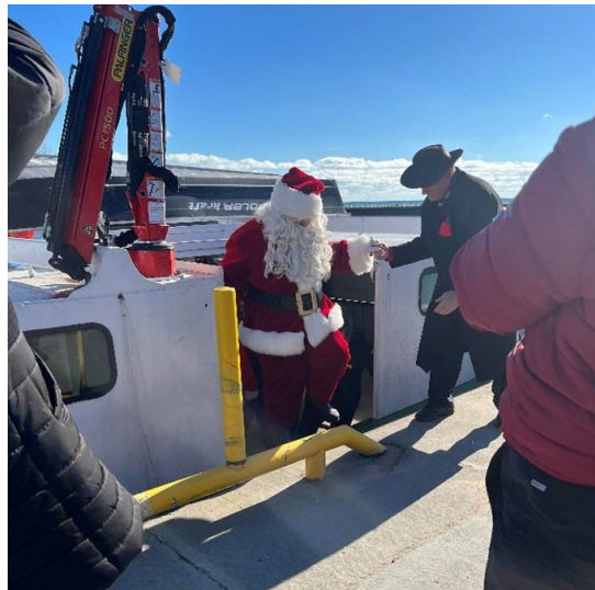
Santa is helped out of the tug by Port Dover's official town crier.

With the assembled crowd cheering, the Coast Guard cutter swings around in a circle after which a fish tug with Santa and Mrs. Claus waving approaches the pier. Finally, the magic. Santa steps out of the fish tug and greets the crowd. Kids from 2 to 80 cheer wildly!