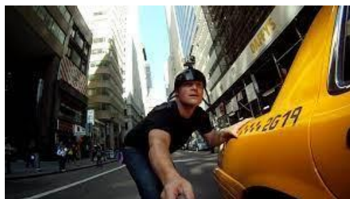
Skitching is the modern replacement for hitching. No snow is required.

According to the “Urban Dictionary,” the word skitching is a combination of “skate” and “hitching.” The definition of the activity includes bicycles, skateboards, and traditional roller skates in addition to the more common rollerblades. In addition to those fair-weather methods, wintertime skitching includes sliding behind cars on snow-covered streets. Skitching has become so “legendary” that several electronic games have been developed in which gamers earn points by hanging onto vehicles in traffic, sling-shooting from one car or truck to another and achieving elapsed time or distance records quite like Bay Rats did during the 1950s.