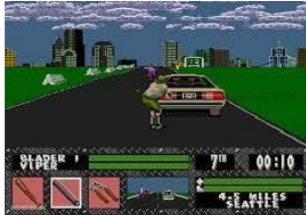
Screen shot from a modern sketching video game

Who knew that we Bay Rats were revolutionizing a modern sport/transportation system/electronic game? Bay Rats were innovators.