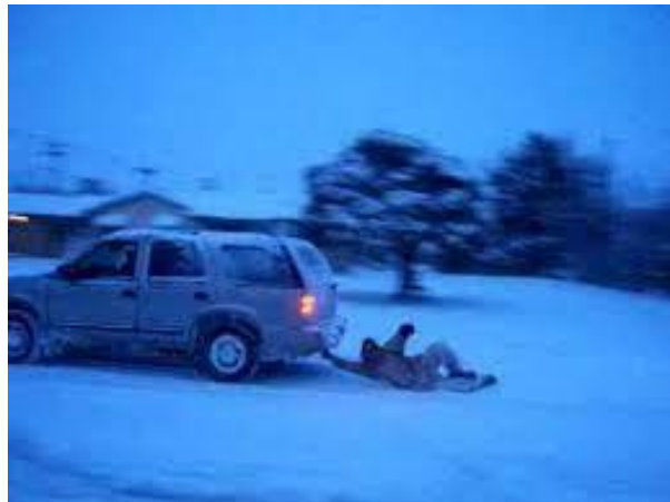
Bumper hitching or, as it sometimes turned out, dragging

It was an exciting cross between water skiing and bobsledding, and the only requisite was snow. More than some snow, it had to be the kind of big snow that covered the concrete streets. That is why our regular hangout, West Fourth Street,