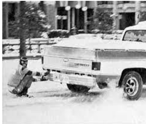
This modern bumper-hitching photograph illustrates the essence of the sport.

Then when the car pulled away from the intersection the fun began. There would be several kids sliding along while holding onto the bumper. There were prizes for elapsed time, top speed, and total distance but we never worked out the fine details of which metric was most important.