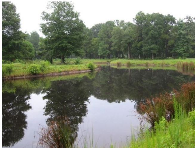
The grounds, which are almost adjacent to the ocean, feature lovely hiking trails and scenic ponds.