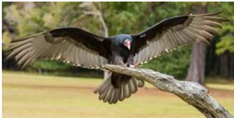
The star of the show, a resident turkey vulture

These days I have a newfound respect for the vultures, which come to Erie each spring. I look forward to their annual arrival.