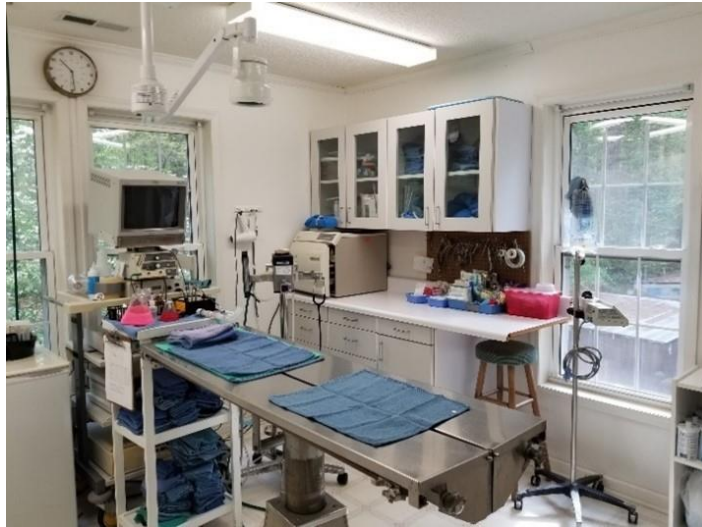
The clinic, where bird patients are treated