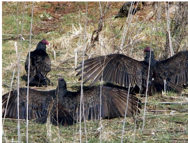
Buzzard Sunday has been celebrated each year in Hinckley, Ohio since 1957

The annual bayfront buzzard arrival made us imagine that we were treading on dangerous ground when we walked the paths along the bluffs. There was probably no quicksand but who knew what dangers could present themselves if we slowed down or stopped for too long? The buzzards were always there. Watching. Waiting. But we were brave. Years passed and I somehow decided that the buzzards (turkey vultures) were not really a threat. They were a regular spring and