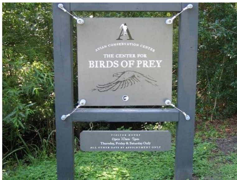
Entry Sign for the Birds of Prey Center

After extolling their intelligence and explaining that all of the trainers favored turkey vultures over almost all of the other resident birds because they were fun and friendly, the young biologist who was hosting our group continued with a discussion of the importance of the sometimes-vilified bird. Their unique physiology allows them to digest almost anything, including rotten carrion from roadsides, and when their digestive systems process replace it, the “new compound” has been completely sanitized. This process makes the turkey vulture nature’s complete sanitizing system. Without turkey vultures much of America would soon become rat infested.