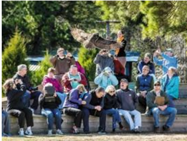
One of the many flying bird shows

These days I have a newfound respect for the vultures, which come to Erie each spring. I look forward to their annual arrival.