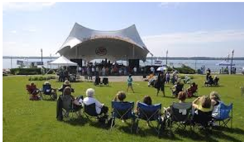
The old Bay Rat sand dock has been transformed by Bayfront development. It has become Liberty Park, a beautiful concert venue and an amazing improvement in public use.

lovely park with playground equipment, a concert venue, and ferry landing.