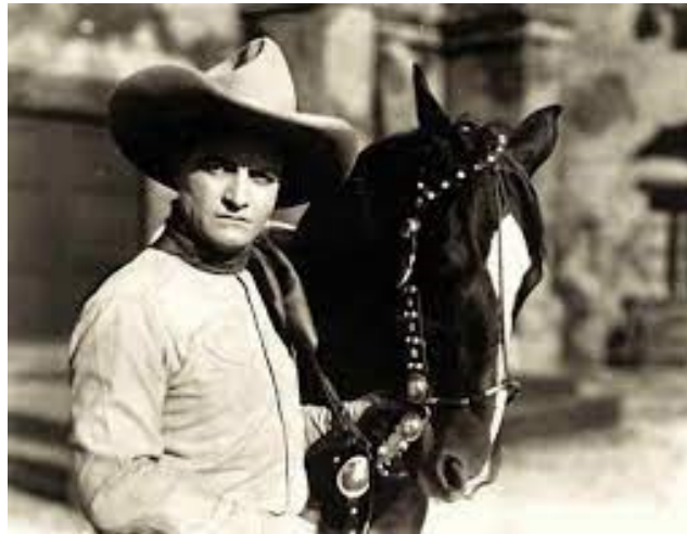
Tom Mix poses with his horse, Tony. The early cowboy film star was born in Driftwood, Pennsylvania, south of Emporium in Cameron County.