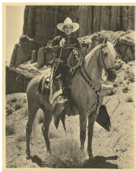
Ken Maynard and his horse, Tarzan

Ken Maynard made a large number of "B" movies, typical Gem Theater fare. Toward the end of his film career, he teamed up with two other seasoned stunt rider-cowboys, Hoot Gibson and Bob Steel, to make a final series of films. The heroic threesome was known as the "Trail Blazers." To describe Trail Blazers' films as second-rate would be an enormous compliment, not that we noticed as we ate our popcorn and cheered wildly.