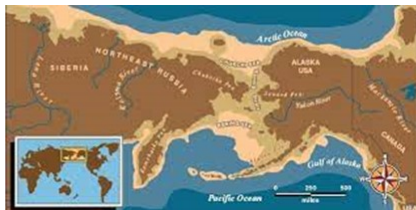
Beringia is the land bridge between Russia and Alaska. Light brown areas in the map above are now underwater.

Beringia was not the only ancient human route to the Americas. Recent evidence suggests that it was one of three pathways. Asians had arrived by boat long before the land bridge and traveled south along the Pacific Coast to South America (Monte Verde Hypothesis). And Northern Europeans came from the other side of the continent, following ice flows through Greenland (Solutrian Hypothesis).