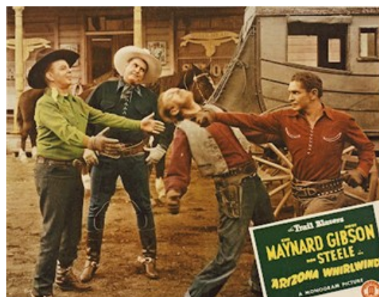
The "Trail Blazers" in action: Bob Steel pummels a hapless bad guy while Hoot Gibson (left) and Ken Maynard (in his signature back outfit) watch.

The more modern (1950s) generation of cowboys, Hoppy, Gene and Roy, also rode horses that often seemed more remarkable than their riders. Gene and Roy both made cameo appearances in Erie with their horses, Champion and Trigger. They sang songs and told stories when they were at Gannon's basketball auditorium but the biggest round of applause came when they asked their steeds questions, which were answered in a code in which the number of hoof beats on the floor indicated the response. For example. Question: Roy asks, "Trigger, how old are you?" Answer: Trigger responds with 10 percussions of his right-front hoof