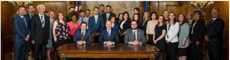
The Civic Leadership Academy cohort of 2017 with Governor Tom Wolf

“The Jefferson’s commitment to this community is remarkable and the Civic Leadership Academy is an awesome avenue to join in the commitment and learn more about where we live.”