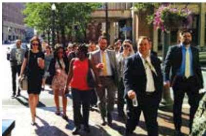
The 2016 Civic Leadership Academy in Harrisburg during retreat