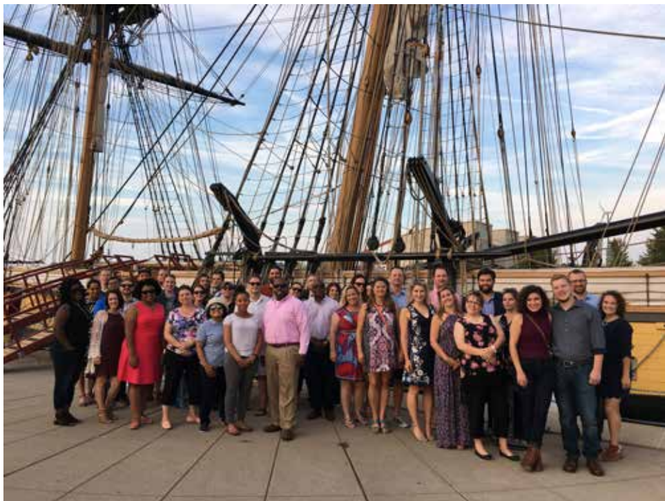
The JCLA Alumni Network during a networking event with the Flagship Niagara League.

Members of the 2018 Civic Leadership cohort will have the opportunity to meet with alumni throughout the year. Upon graduation, members of the 2018 cohort will be welcomed to officially join the network.