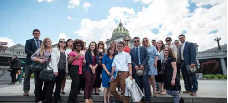
Civic Leadership Academy 2017 cohort in Harrisburg during the retreat.

Through the Leadership Academy, students examine the inner workings of local governments to emerge as civic leaders capable of effecting positive change for Erie County's future with an understanding of Erie's past and present. With a close look at Erie's economic, entrepreneurial, and innovation ecosystems, the Leadership Academy informs mindful leaders of Erie's post-industrial landscape while exposing them to global ideas that can be applied to Erie County's overall developmental health and well-being.