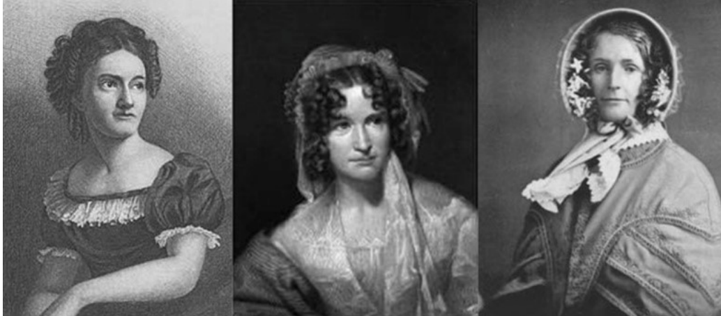
Lydia Maria Child

So, who was Lydia Maria Child? Well, she was no shrinking violet and, I suspect, she was someone who irritated Sarah Josepha Hale. Although she had started to write before she married and her husband did not die, his inability to earn a sustained income drove Child to follow Samuel Johnson's famous dictum – "No one but a blockhead ever wrote for anything but money." Child became one of the most successful American writers of the 19th century.