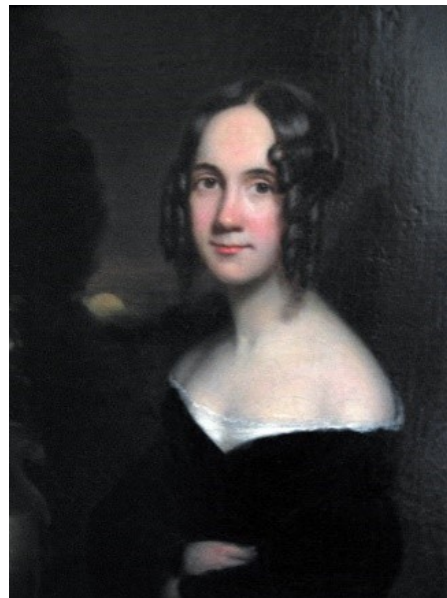
Sarah Josepha Hale

Happy Thanksgiving! Be Grateful for Hale, Child, too