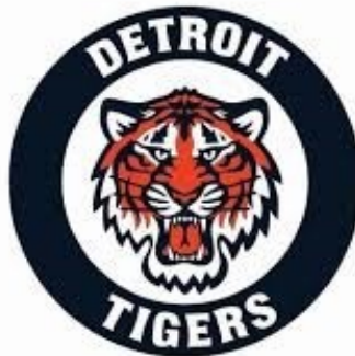
Detroit Tigers logo