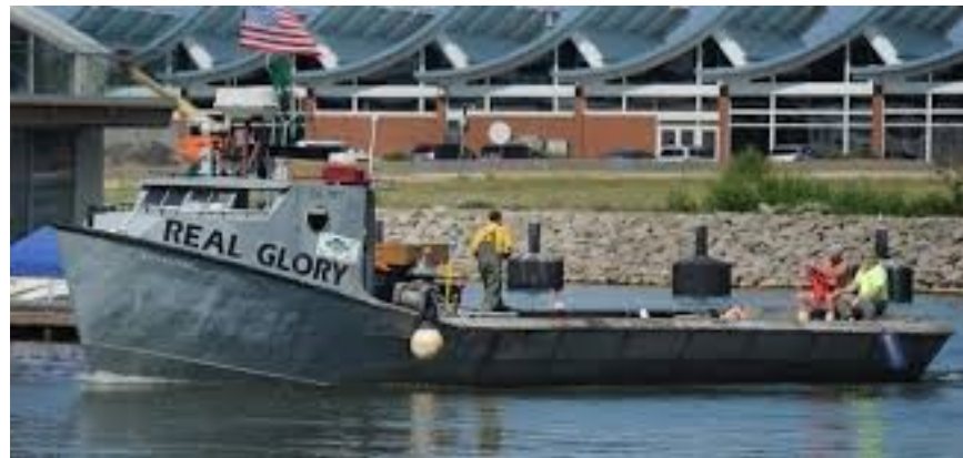
Erie’s last commercial fishermen will sell you fresh yellow perch. Find the boat in the East Slip and give them a call.

My favorite perch dinner is served at the Erie Beach Hotel in Port Dover near the docks where commercial fishermen continue to gillnet for the Lake Erie delicacy. Erie Beach perch are very lightly breaded and gently pan fried, using a recipe that has been carefully followed for almost 50 years. The perch there are small by contrast with the slabs of deep fried “perch” served locally, but they are real yellow perch, and fresh. The current menu price for a five-ounce perch dinner at the Erie Beach is $20. Expensive but well worth the experience, which returns taste buds to 1950s Erie. The only way that the Erie Beach can offer that price is by buying in bulk, and directly from commercial fishermen. I have eaten at the Erie Beach with American sailor friends who inspect the perch dinner as it is served and complain about the size of the portions and the price, muttering about how they were given bigger portions in Erie for less money. They don’t understand.