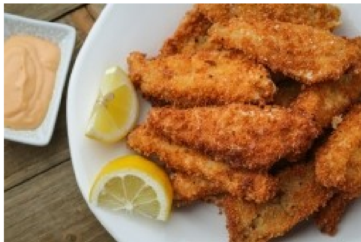
When available, wild caught yellow perch fillets from Lake Erie that were processed at Leamington, Ontario, and marketed as organic, are sold for $20 per pound retail.

The rebranding in Port Dover was made smoother by the relatively confined space, small number of entrepreneurs, and a general spirit of cooperation. It took longer in Erie, but it finally happened. For several decades, yellow perch were elevated to the role of “most tasty and desired local fish,” on both sides of Lake Erie, but eventually they began to decline, as well. These days the once “rough fish” that became a local favorite seems to be following the herring and blue pike into obscurity. If a persistent shopper can find authentic Lake Erie yellow perch, which is not always possible, the price is about $20 per pound, retail. Aquatic gold.