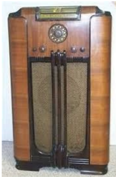
A floor model radio was the epicenter of my family's evening entertainment

After another basement workshop raid, I uncovered the guts of a small table-model radio, which had a standard tuner with a dial and numbers. The only thing missing was a power cord. But there were several disconnected bits of wire with switches and plugs and I was able to cobble together a power cord and wall plug. By luck or magic, after I connected the cord to the place where there seemed to be a missing one and plugged the radio into a wall socket, it worked! A few dabs of solder (I had watched my father do it) and some electrical tape and I was in business. My work might not have passed stringent modern electrical codes, but why fret over details in a house equipped with knob and tube wiring?