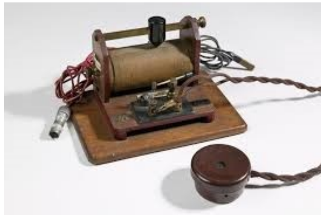
Typical basic crystal set, with one headphone

Instead of fighting against bedtime, I would happily retreat to the bedroom, hook up the crystal radio and begin a nightly routine of searching for stations. But there were problems. No matter what metal object I hooked up to or where I stuck the antenna it was difficult to find stations. Unlike the family floor model radio in the living room, which had AM, FM, and Short Wave bands that could bring in hundreds of interesting broadcasts, my crystal set was not good at finding stations. There was no tuner in the traditional sense. Just a pointer that could be pushed along a copper core. If I was lucky enough to find a great station one night, I would have to start from scratch the next evening as I pushed the tuning needle across the copper coil. The headboard of my bed was made of steel, so that was where I attached the alligator clips.