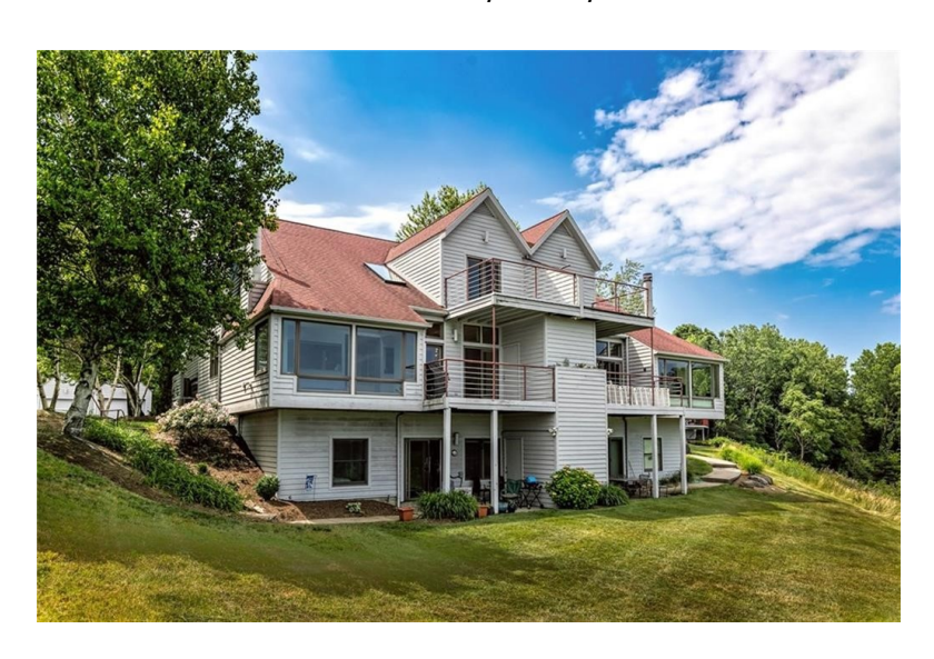
Manicured lawns at the Bluffs Condominium development now grace the former left field deck.