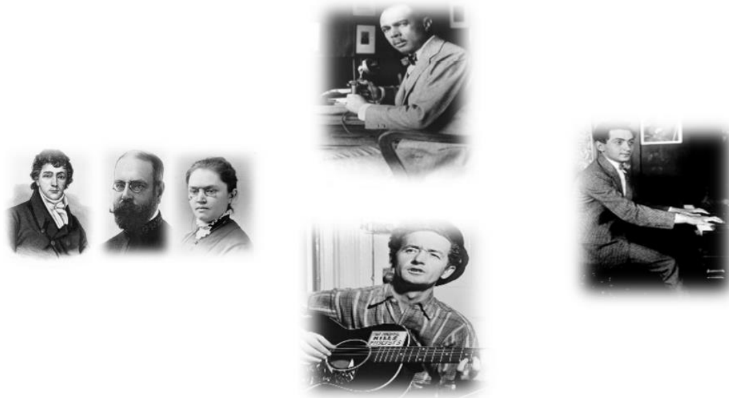
Clockwise from left are Francis Scott Key, John Philips Sousa, Katherine Lee Bates, James Weldon Johnson, Irving Berlin, and Woody Guthrie. [1]

Happy Fourth of July! Happy Independence Day!