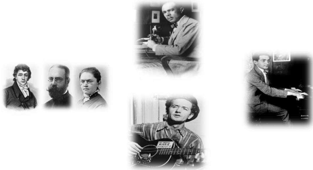
Clockwise from left are Francis Scott Key, John Philips Sousa, Katherine Lee Bates, James Weldon Johnson, Irving Berlin, and Woody Guthrie. [1]

With the Fourth of July fast approaching, that metaphorical marker of summer's midpoint celebrating America's founding and freedom's triumph, I thought it an apt time to explore patriotic American songs that sing about common objects of our love that St. Augustine says bind a people into a nation.